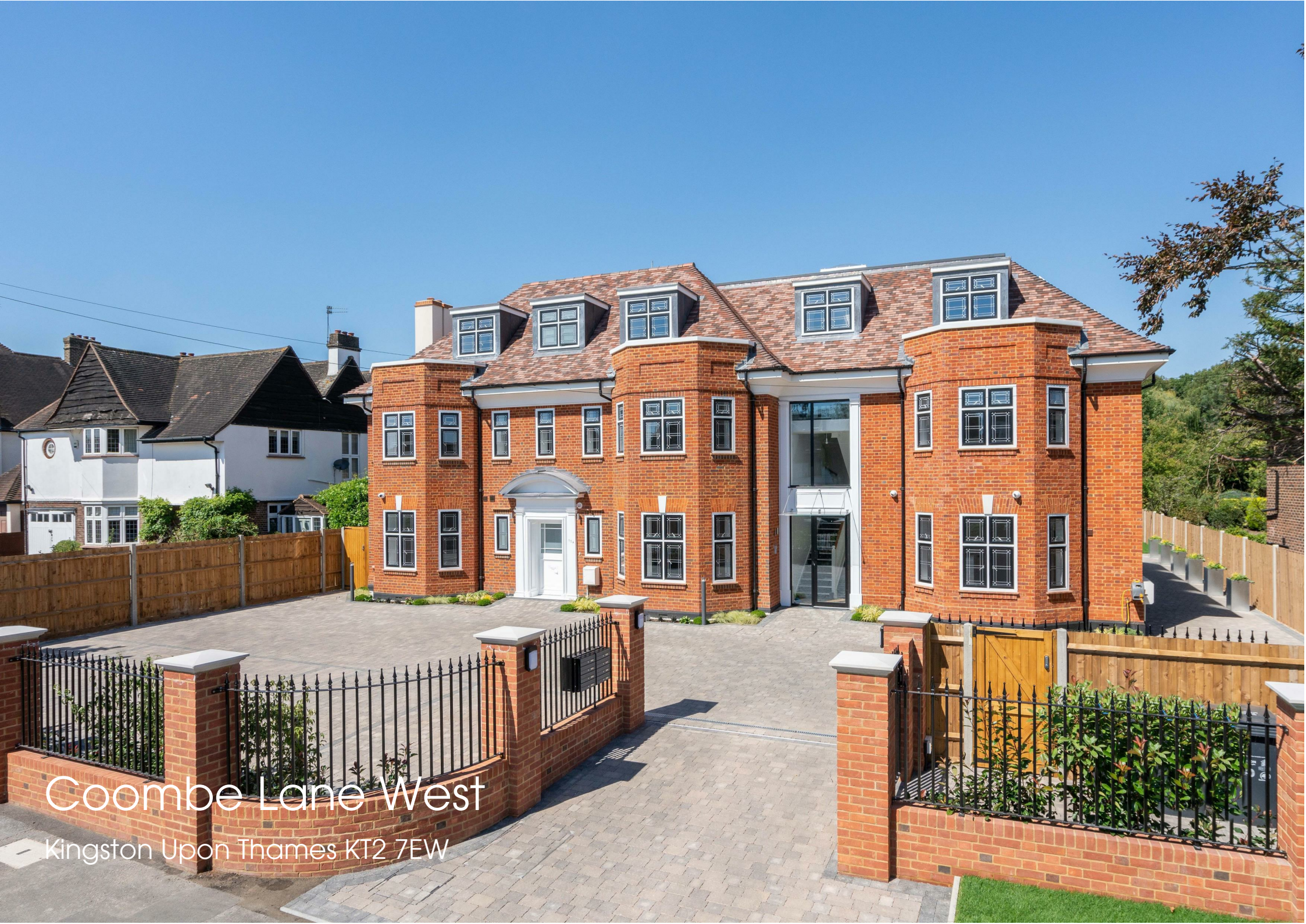
Coombe Lane West Kingston Upon Thames KT2 7EW